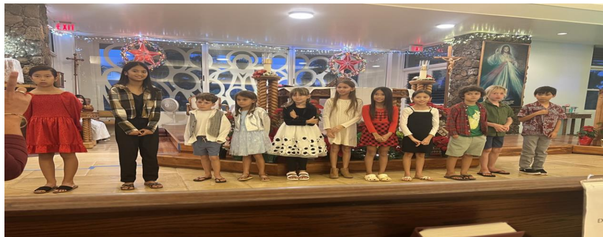
CHILDREN CHRISTMAS MASS