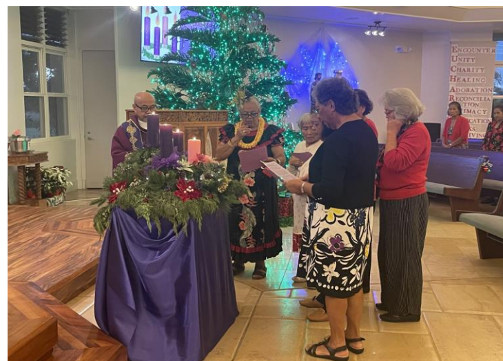
LIGHTING OF WREATH ADVENT CANDLES

Wishing you abundant blessings in the 2024 New Year